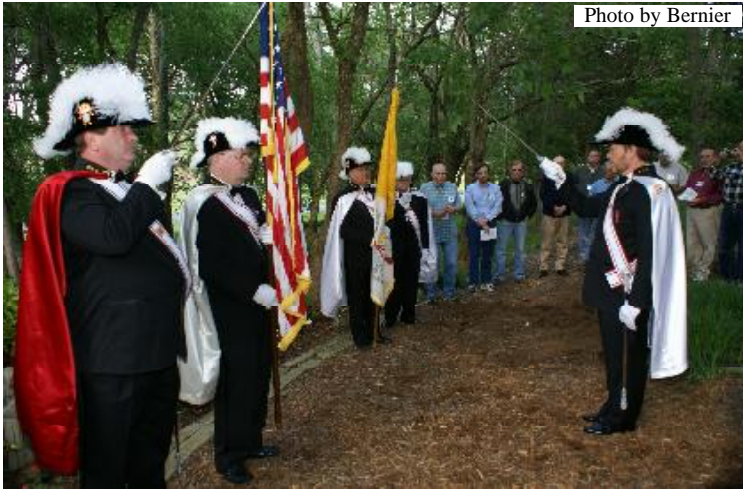
Honor Guard Salutes Our Fallen Brothers