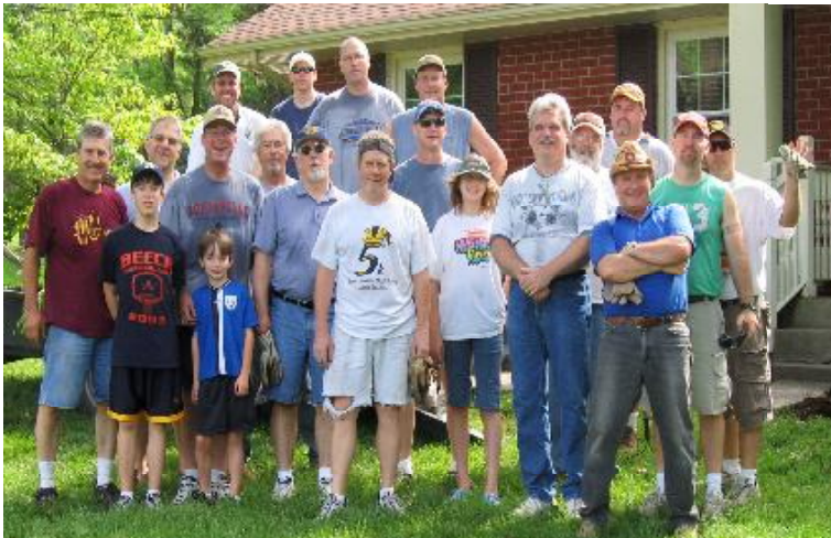
The Whole Motley Crew - They May Not Look Like Much But They Sure Do Good Work