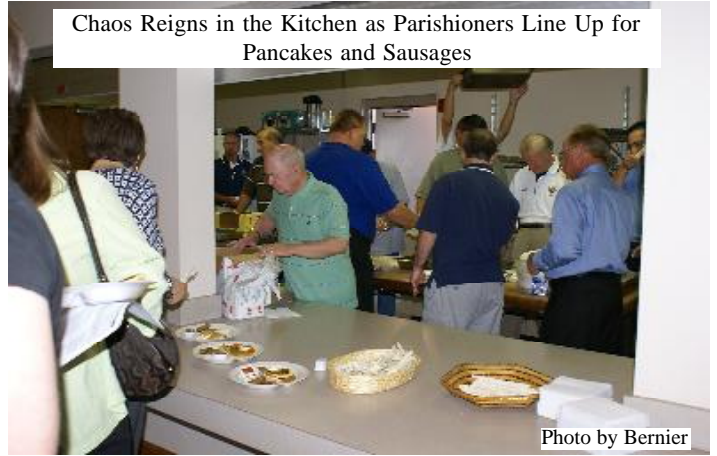
Chaos Reigns in the Kitchen as Parishioners Line Up for Pancakes and Sausages